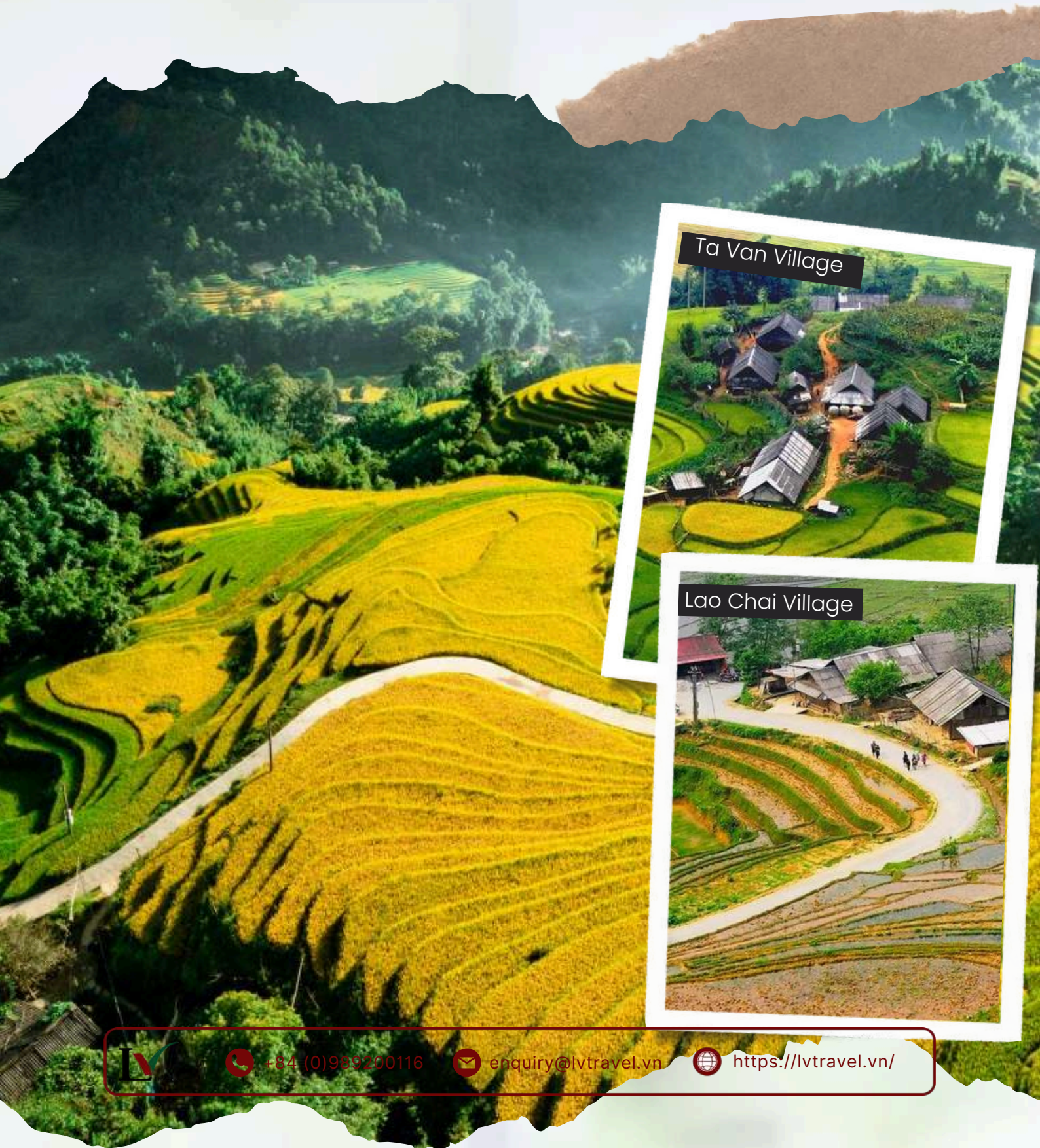
Ta Van Village